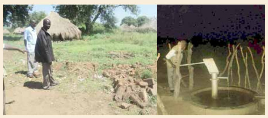
The ruins of a cotton store allegedly weakened by a grader (above left) and one of the boreholes drilled by Total E&P in Nebbi District (right)

concentration on geological survey, the ministry had limited manpower to deal with the emerging issues. He however said the demand to bring on board other disciplines had compelled the ministry to put in place a new structure to cater for recruitment of additional staff to handle the functions that were not originally within the ministry. He also added that the planning process to open a Ministry Desk in Hoima district was in advanced stages. Inspite of all the efforts in place to ensure multi-sectoral coordination in the oil and gas industry in Uganda, the UHRC notes with concern the lack of a strategy to guide such coordination. The UHRC also noted with concern that the lack of involvement of all concerned in the industry may lead to lack of ownership among key stakeholders, which may negatively impact on the growth of the oil and gas industry in Uganda.