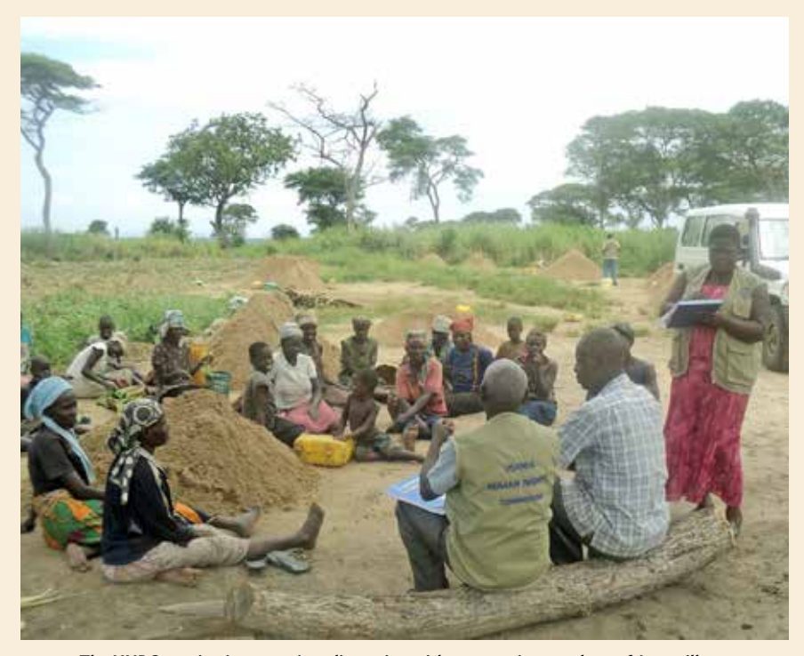
The UHRC monitoring team in a discussion with community members of Joga village, Purongo Sub County, Nwoya District

The policy conferred on the MEMD the main roles of Government in managing petroleum resources, that is, policy making and implementation; regulation of the sub-sector; and managing the commercial/business aspects. The MEMD is therefore the lead agency in implementation of the National Oil and Gas Policy for Uganda. Nonetheless, the policy recognises the role of other MDAs and provides that parent ministries are responsible for guiding and monitoring the work of the operational/managerial agencies placed under them. In addition, the role of local governments, CSOs, and cultural institutions can play is recognised by the policy particularly regarding advocacy, mobilisation and dialogue with communities empowering them to participate effectively and also hold duty bearers accountable.