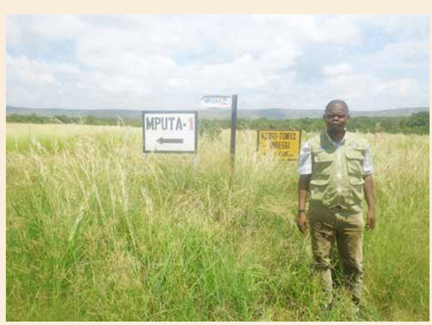
A UHRC staff in the vicinity of oil wells in Hoima District Below: An open site in Pakwach TC from which murram was excavated by CIVICON still pending restoration