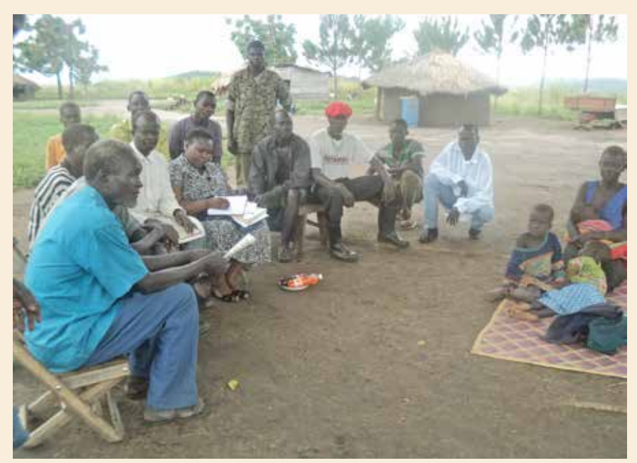
UHRC monitoring team in discussions with community members Below: A house in Buliisa District reportedly cracked by vibrations from the oil exploration activities